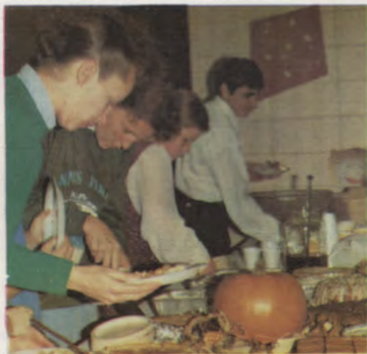
Delicious food was served during the ABI Wives' Fall Fun Night.