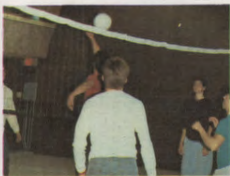
The gym is the site of a volleyball competition each week.