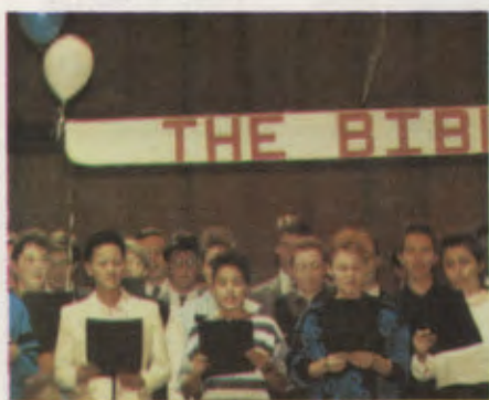
Seniors present a Choral Reading to a student assembly.