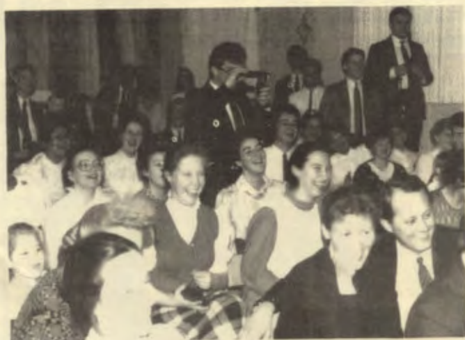
Skit night - a great time for all! The fun-filled evening included skits, music and prizes.