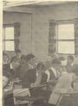
A Second Year English class at ABI