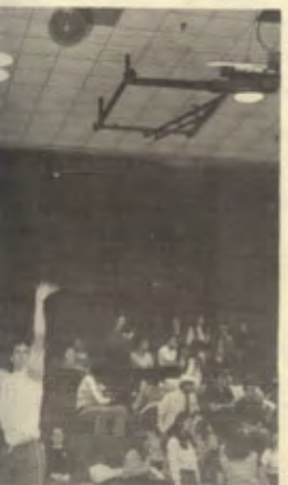
[unclear] in Whitley, AR, shoots a basket at Annual Basketball Game

YES! I am interested in the school where education is a joy