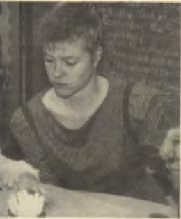
Teachers in Primary Sunday School