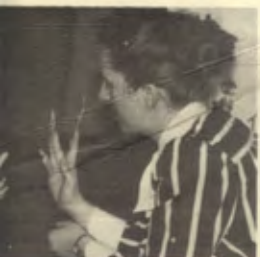
Toddler how to use finger puppets