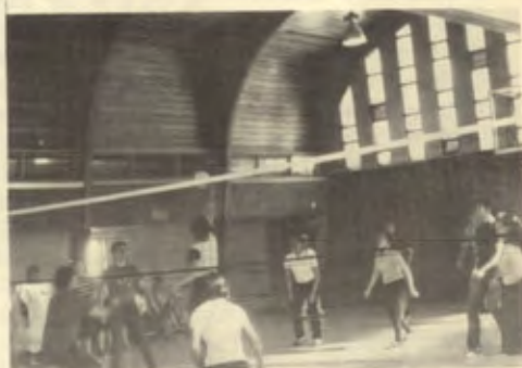
ABI Annual Volleyball Tournament