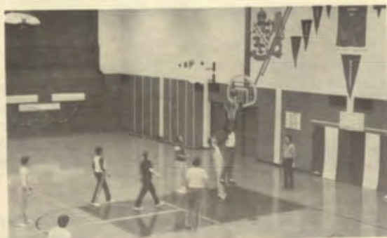
ABI Basketball Tournament 1984