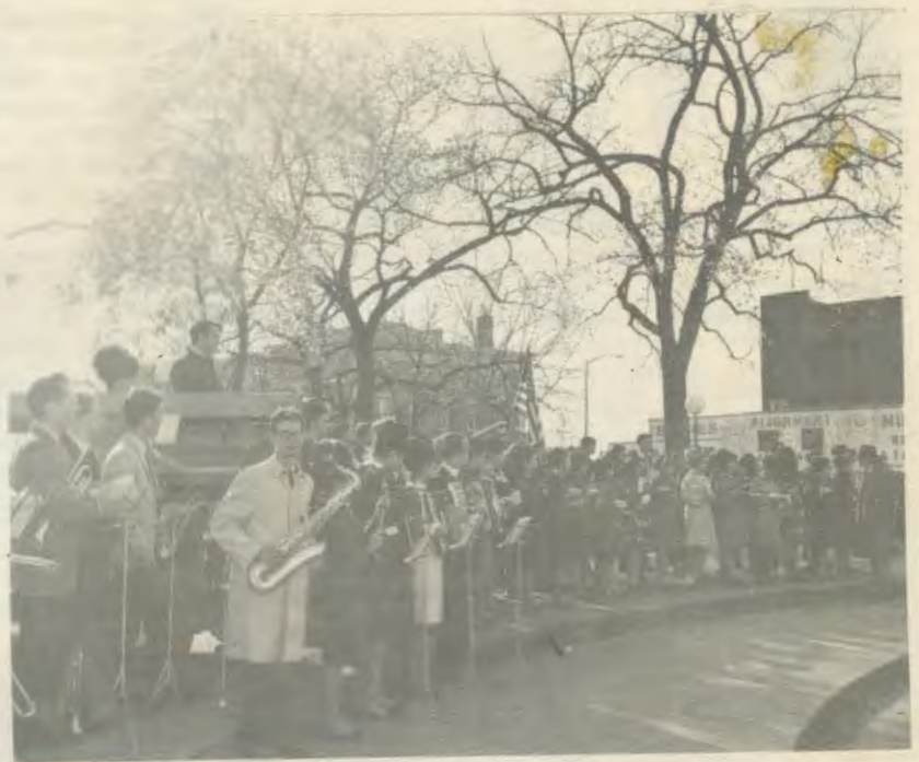
Marchers gathered in a park to sing and play Gospel and patriotic songs.