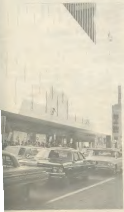
Contributed to St. Paulites march.