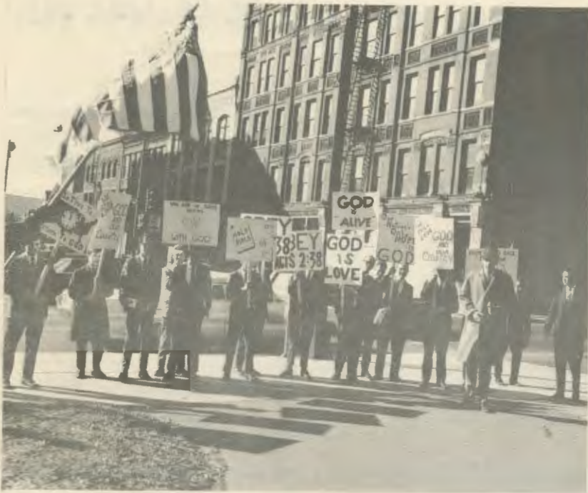
A.B.I. students marched thru downtown St. Paul with banners and Bibles proclaiming their love for God and country.