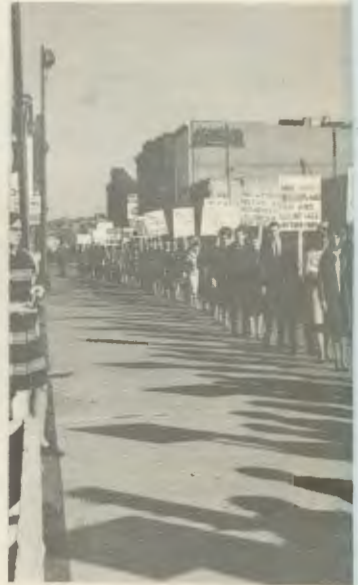
Hundreds of tracts were distributed by A.B.I. students during the march.