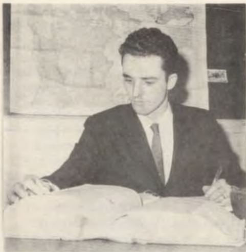
STUDY TO SHEW THYSELF APPROVED