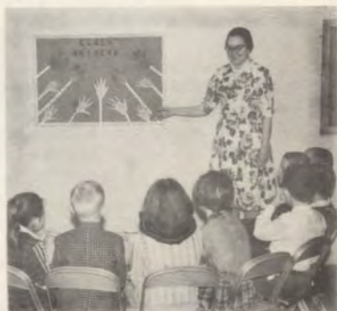
WORKING WITH CHILDREN