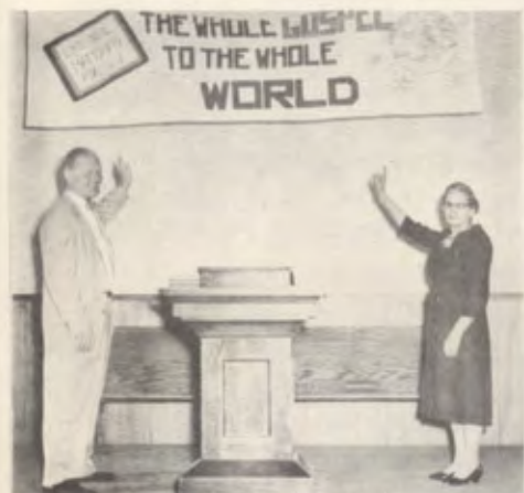
STRONG MISSIONS PROGRAM