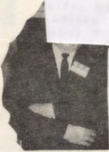
Rev. & M