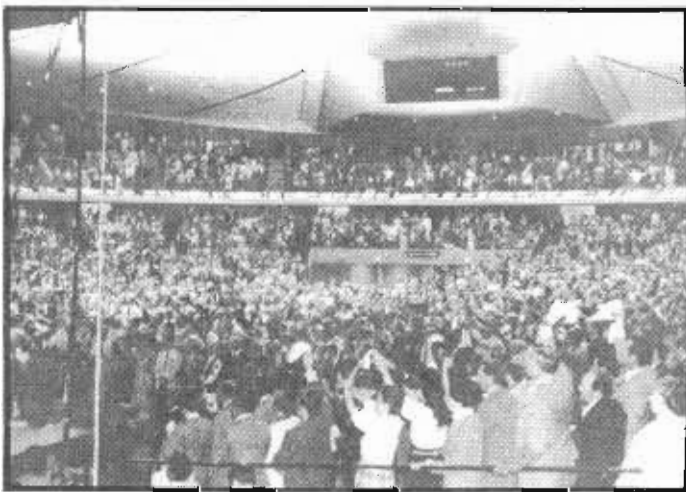
GENERAL CONFERENCE 1984 - ANAHEIM, CALF. is the setting of the worship service pictured above. Each night the convention center overflowed with pentecostals from around the world. Each service was blessed of God in a special way. Kentucky was well represented at this conference. Pictured at right are those I caught before losing my camera.