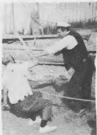
'Seaman Crook' puts up a fight and is injured.