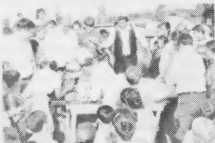
The camp nurses, Sister Rucker and Sister Hoagland work hard to save him.