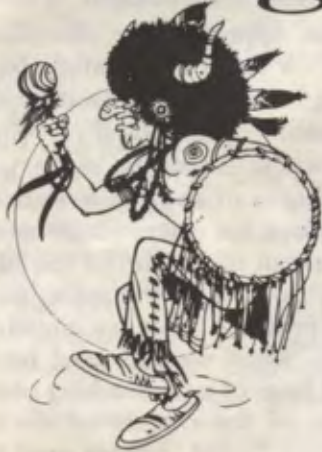
Rev. Dan Deaton

Two thousand miles away on the little island of Haiti, about 35 miles from the town of Port-Au-Prince, in a small village called Vigner, I was bent over looking through the open window of a tiny mud hut. Inside, the walls were lined with scared faces of which some were crying. I had tried to get through the open door, but it was jammed with spectators. So from one window to another we went, Alexson and I.