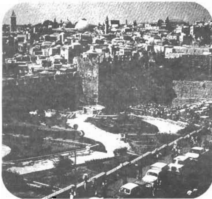
JERUSALEM, Israel: The Damascus Gate which leads into the old walled city of Jerusalem is one of the busiest of the many city entrances. On the Jerusalem skyline are the twin domes of the Church of the Holy Sepulchre.