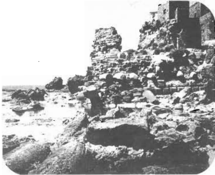
CAESAREA, Israel: Roman pillars mark the shore at Caesarea, the Roman capital of Israel. Crusader invaders who captured the city used the Roman pillars as reinforcement for the walls of the city they constructed here. The more recent buildings date from the Turkish occupation.